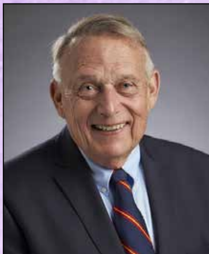
Martin J. Schreiber Former Governor of the State of Wisconsin and Family Caregiver

Presentation by Martin J. Schreiber, Former Governor of the State of Wisconsin and Family Caregiver